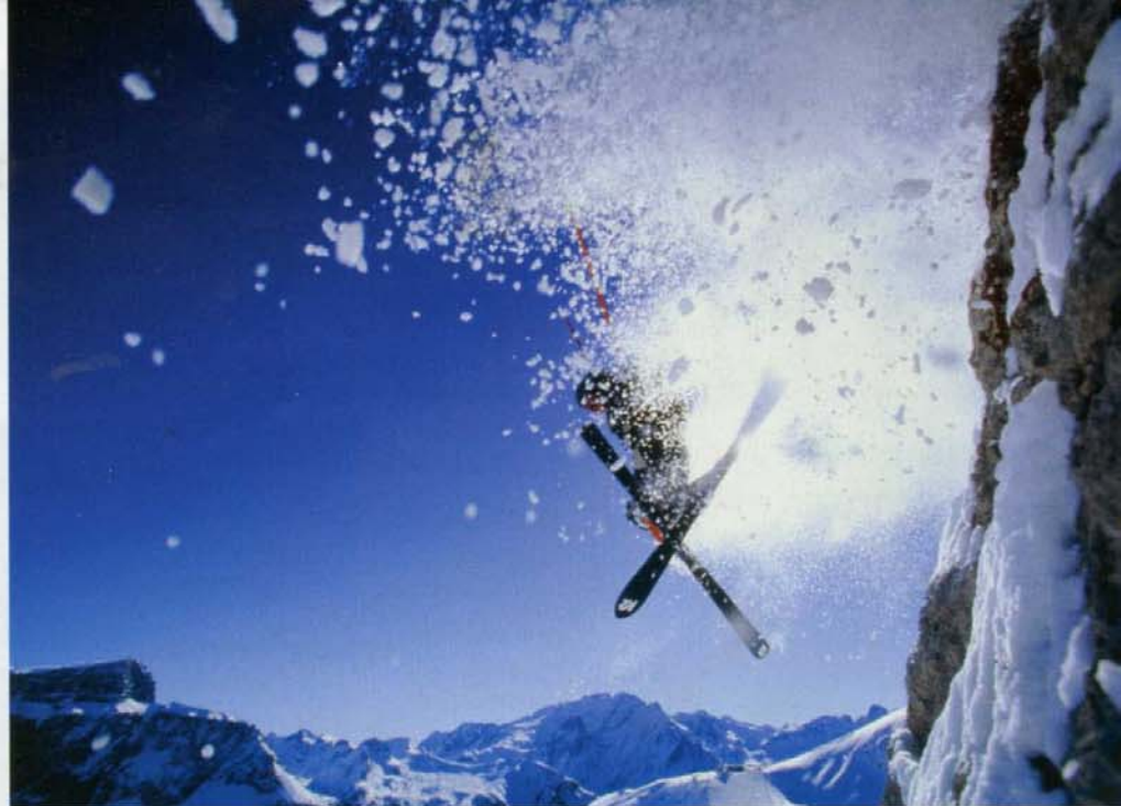
Above: the Dolomites are this year's hot skiing destination.