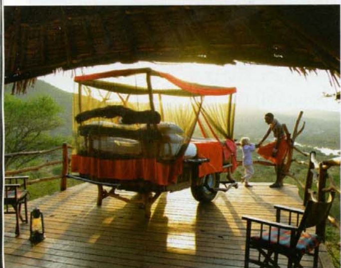
Above: sleep under the stars in a Koiya Star Bed in Laikipia, Kenya. Below: North Korea beckons with Steppes Travel's escorted 16-day trip.

Nightlife on ST BARTHS may be higher octane but it is equally scene-conscious. Pink Elephant ( www.pink-elephantclub.com ) is a new indoor/outdoor Beach Club (from the people behind the eponymous Hamptons venue) adjacent to Saline Beach with seating alcoves and day beds for lazy afternoons, Cristal in hand. Later in the year, Pink Elephant will be making cameo appearances on the CÔTE D'AZUR – at the Cannes Film Festival and Monaco Grand Prix. ♦