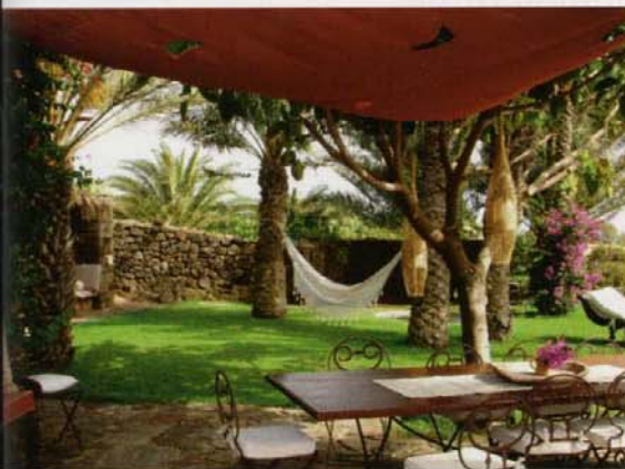
Above: the super-chic villa Casa N in Pantelleria, Italy. Below: Imam Mosque in Isfahan, Iran, where Wild Frontiers soon ventures for the first time.