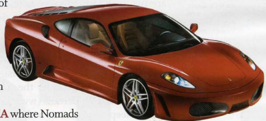
Above: Red Travel tailor-makes itineraries in Italy for clients wanting to drive one of its top Ferraris, such as this F430 F1.