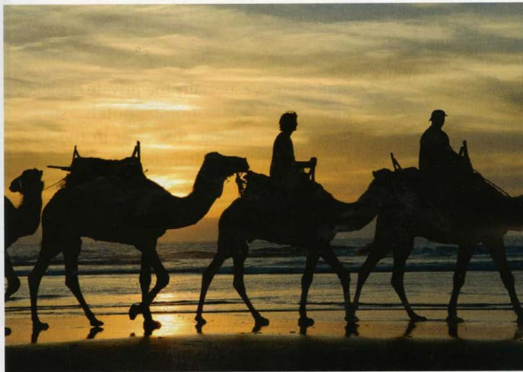
Above: camel riding on the beach at Essaouira, where the new Riad Lotus O Marine is located.

For those who prefer to get their kicks from skiing, all talk is of the DOLOMITES – one of Italy's better-