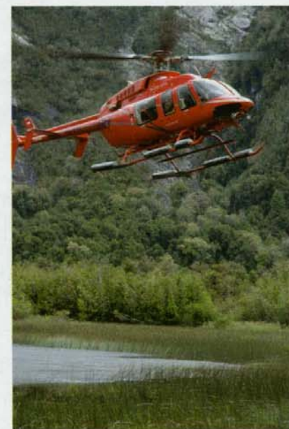
Above: haute luxury meets high adventure on Nomads of the Seas' Patagonia trip.