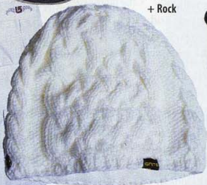
Wool hat, £19.95, Snow + Rock