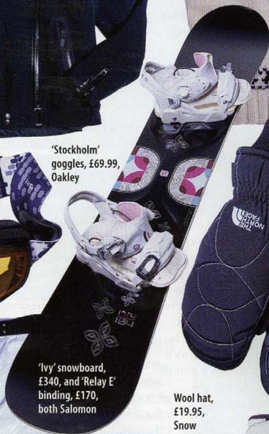
'Ivy' snowboard, £340, and 'Relay E' binding, £170, both Salomon