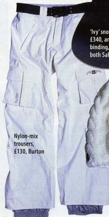
Nylon-mix trousers, £130, Burton