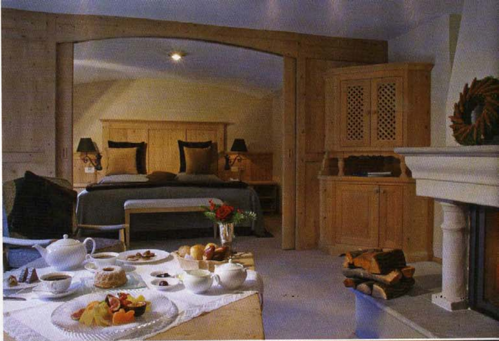
This photo and above: the spacious rooms at Rosa Alpina fuse alpine design with Italian elegance