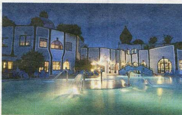
Thermal springs are at the heart of this spa experience

For a guide to the best-value detox retreats around the world and new spas to look out for in 2009 visit: timesonline.co.uk/goodspaguide